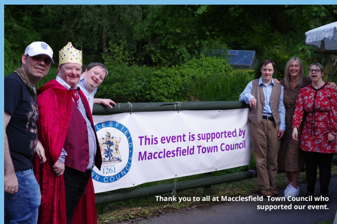
Thank you to all at Macclesfield Town Council who supported our event.

"What a wonderful place to work, with wonderful people! So lovely to be able to celebrate with the staff and tenants. Everyone loved the afternoon and the weather was kind to us!! What a lovely way to spend a day at work!!! "