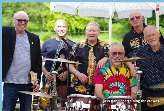
Jaxx Band entertaining the crowds.